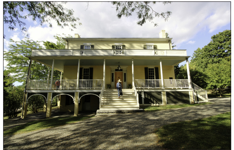
Exterior, Main House, Thomas Cole National Historic Site. Escape Brooklyn photo.

The Cole Site's activities include guided tours, special exhibitions of both Nineteenth Century and contemporary art, printed publications, extensive online programs, activities for school groups, free community events, lectures and innovative public programs such as the Hudson River School Art Trail — a map and website that enables visitors to visit the places that Cole painted. The goal of all programs at